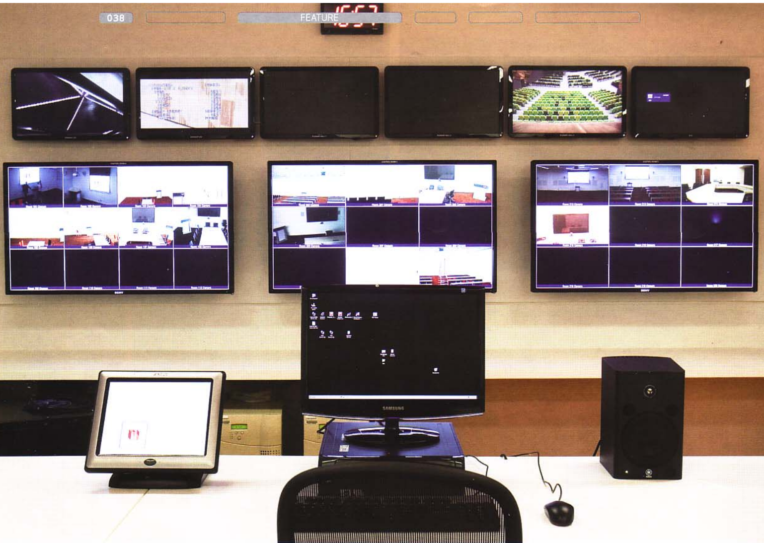
Master Control, showing monitor wall, master AMX Modero touch panel and control computer. The top row of monitors show (left to right) dedicated feeds from both cameras in the Grand Banquet room and all three Plenary cameras. The last monitor is a switchable preview of the in-house IPTV system. The three 47-inch LCD panels display the incoming meeting room camera feeds aggregated by the Avitech VCC-800c video command centres in each of the local control rooms. All video everywhere in the MCEC is full 1920 HD. The standard MCEC dual redundant uninterruptable power supplies can be seen nestled under the monitor wall.

monitor, configure, operate and provide timely support to the rooms in their immediate area. These control rooms also link to the unmanned (cold and noisy) server room, where the main communications entry points, shared data processing, transcoding, conferencing gateways, storage systems and central signal routing facilities are located.