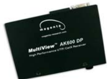
Multi View AK600DP-SAP Receiver 400R3769