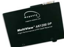
MultiView AK1200DP-SAP Receiver 400R3694