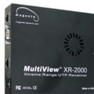
MultiView XR-2000DP-SAP Receiver 400R3585