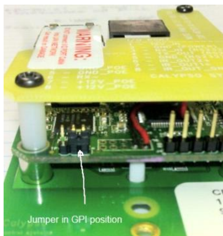
Default Jumper Position = GPI function